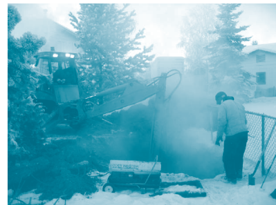
CUC employees perform winter system maintenance.

tures combined with a very low snow accumulation provided deep ground frost levels. The extreme cold posed significant operational challenges to water distribution and wastewater collection systems. Our company was challenged to maintain uninterrupted service and we appreciate the understanding of our customers during what at times were challenging tasks. I am happy to report that most