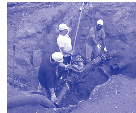
GHU employees install a water main valve on 11th Avenue.

Fill a pitcher with water and let it sit in the refrigerator for several hours prior to drinking. Chlorine reacts with air and will evaporate from the water.